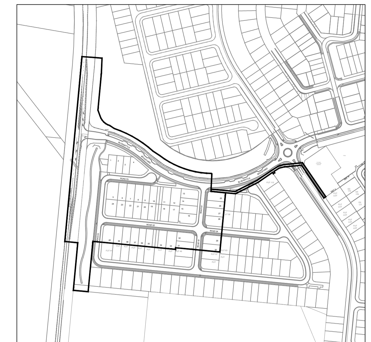
LOCALITY PLAN (N.T.S)